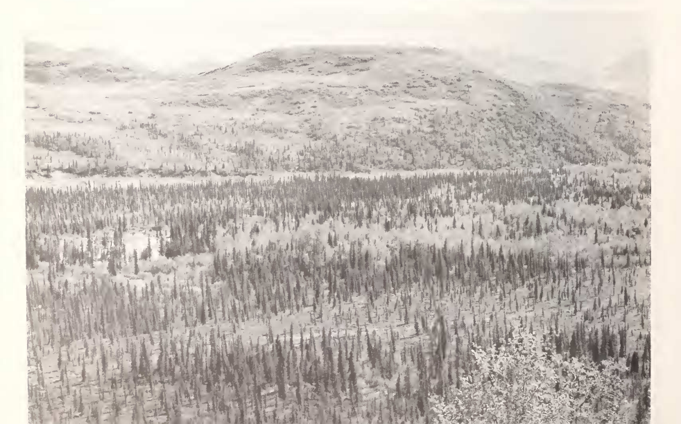
Fig. 3. Vegetation typical of main valley floors and lower hills and slopes; the Tuluksak River at lower Slate Lake and hills to the west, early June 1974.

black spruce, Picea mariana ; paper birch, Betula papyrifera ; and balsam poplar, Populus balsamifera ) are found on the main valley floors and lower hills and slopes (Fig. 3). Broken tracts of alder ( Alnus spp. ) and willow ( Salix spp. ) are found throughout the area beyond timberline (Fig. 4). Tamarack ( Larix laricina ), black spruce, aspen ( Populus tremu -